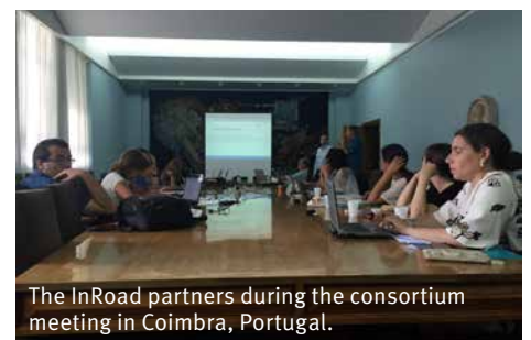
The InRoad partners during the consortium meeting in Coimbra, Portugal.

In September 2018, a validation workshop will take place, in which the RI stakeholders can engage again to validate the projects