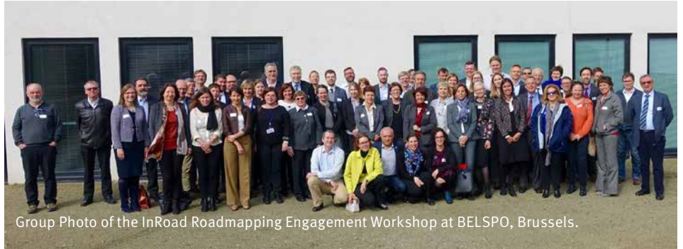
Group Photo of the InRoad Roadmapping Engagement Workshop at BELSPO, Brussels.

InRoad's most important milestones at a glance