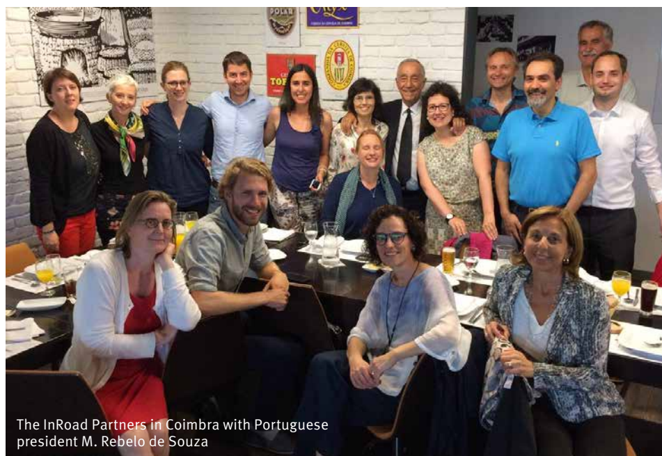
The InRoad Partners in Coimbra with Portuguese president M. Rebelo de Souza

Welcome to the Newsletter of InRoad , a Horizon 2020 project going towards better synchronisation of priority settings and evaluation mechanisms for research infrastructures beyond national relevance.